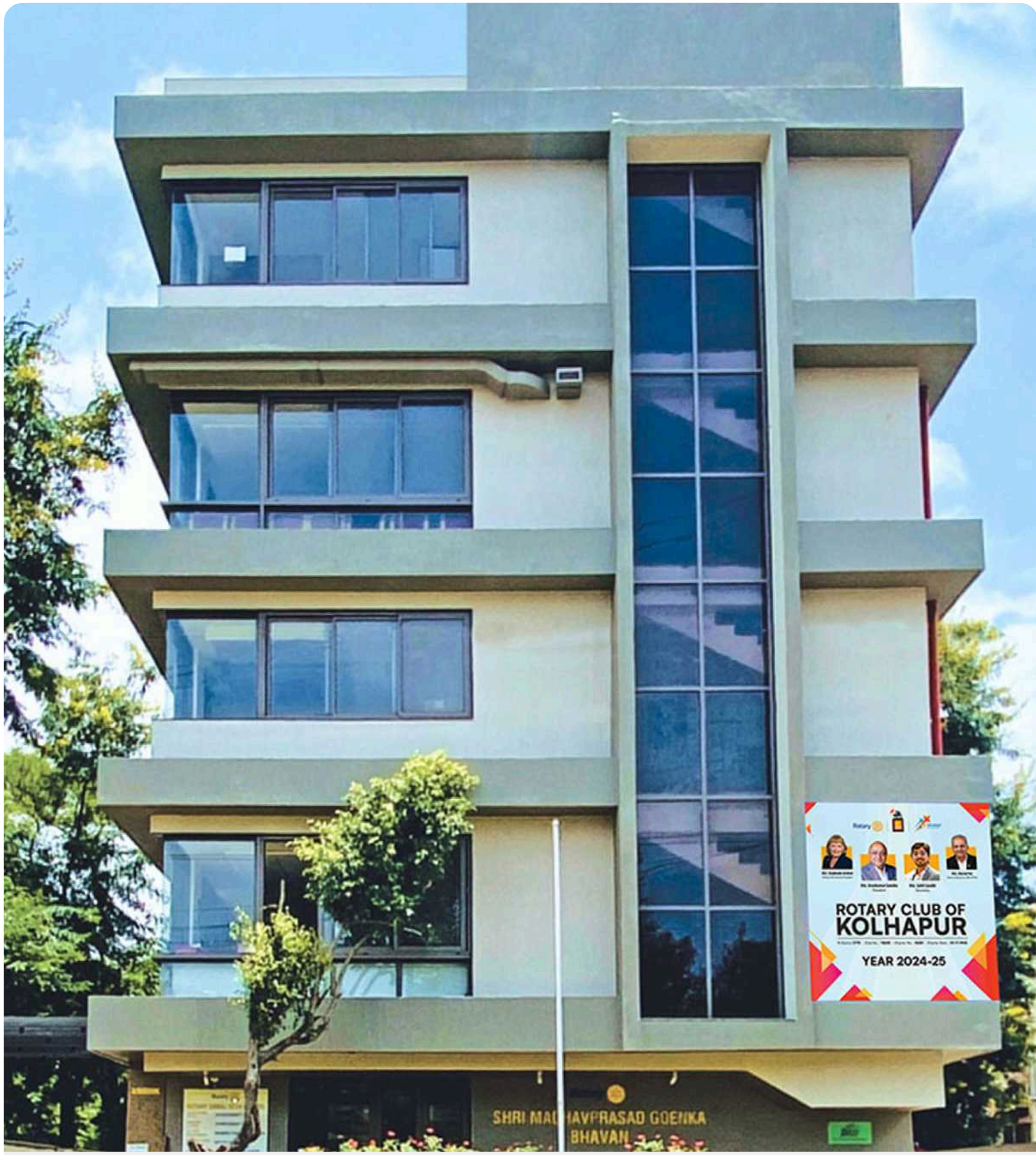
ROTARY CLUB OF KOLHAPUR'S ROTARY SAMAJ SEVA KENDRA BUILDING